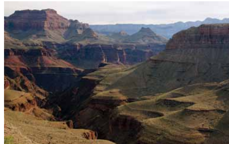
A RIVER CUTS THROUGH IT: VIEW HANCE CREEK FROM HORSESHOE MESA AT MILE 2.3 (ABOVE). THE CONFLUENCE OF THE COLORADO AND LITTLE COLORADO RIVERS (SEE TANNER TRAIL TO BEAMER TRAIL, NEXT PAGE).

Even without ice, the Grandview Trail is intimidating—it drops 3,500 feet in 4.5 miles—but it's not technical. Soon we sink below the freezer zone and zigzag down to Horseshoe Mesa. We've walked into the desert in full spring by the time we hit the Tonto Plateau. We shed our microspikes and fleece jackets, and walk in 70°F afternoon sunshine down to our first campsite, an inner-canyon oasis of