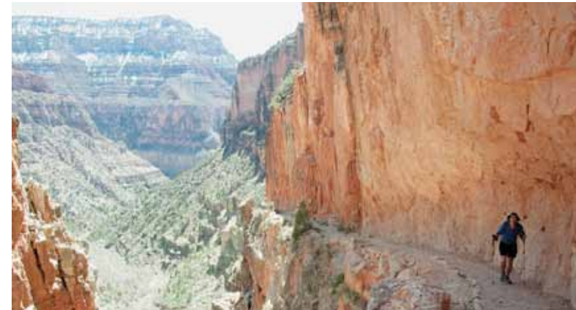
WHAT GOES DOWN MUST COME UP: THE UPPER NORTH KAIBAB TRAIL ASCENDS BESIDE ROARING SPRINGS CANYON. FOR MORE NORTH RIM HIKES, GO TO BACKPACKER.COM/GRANDCANYON .

the canyon, the 3,000-foot-tall walls of Zoroaster Temple cleave the sky like a red warbonnet, and the sun's last rays soften the cliffs of the North Rim. We have eight miles and 4,000 feet of climbing tomorrow—a tough haul for my young kids. But tonight, we're enjoying that sweat equity: a private campsite with a view of time itself. 🌟